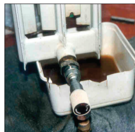
Familiar sludge in a system radiator