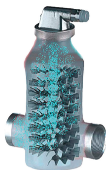
The new Zeparo Deaerator showing the Helicoidal insert